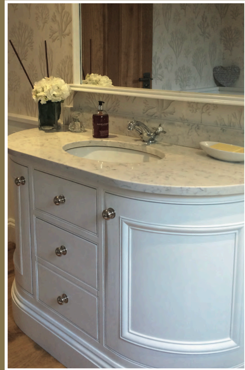
TIMBER SINK CABINET

Dreaming of a home or garden office? We design bespoke oak spaces tailored to your lifestyle, whether for work or leisure. Naturally insulated and full of character, our oak offices offer year-round comfort in a calm, light-filled environment - an ideal investment in both your productivity and your property.