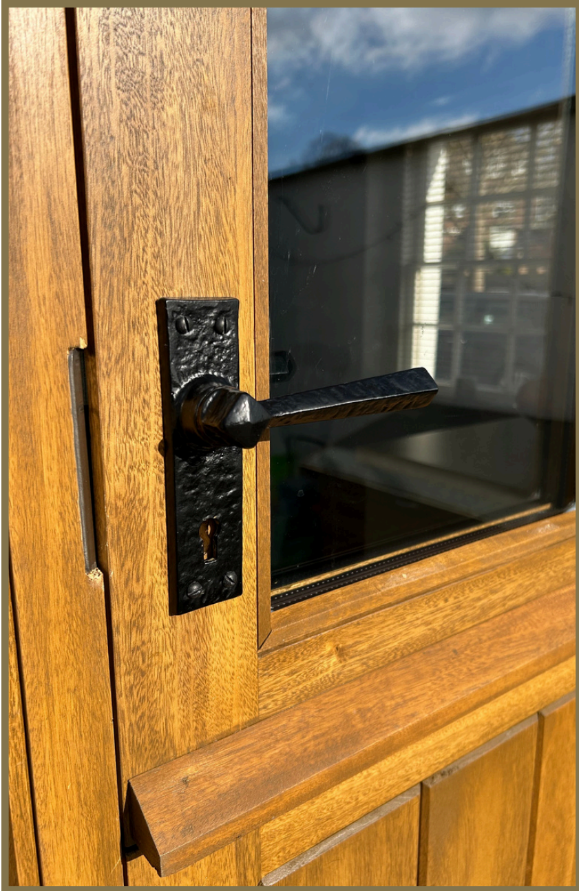
AVON LEVER HANDLE

Whether you're working on a full renovation, a new build, or simply refreshing existing details, our ironmongery collection is designed to elevate the final finish. Many items are crafted by experienced UK manufacturers, with some pieces hand-finished to the highest standard, so you can be confident you're choosing products that combine durability with timeless style.