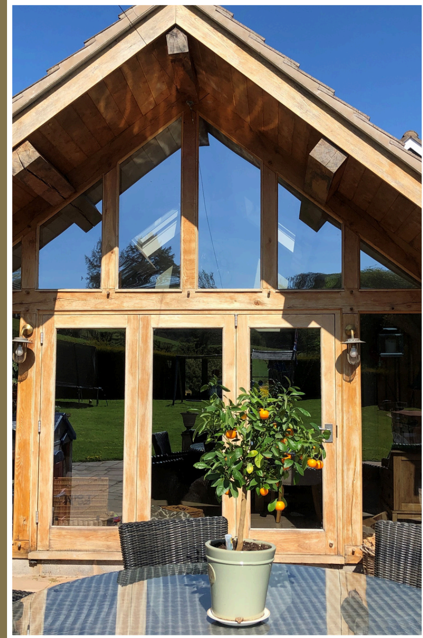
OAK FRAMED EXTENSION

Durable, low-maintenance, and tailored to you, our timber structures are a beautiful way to expand your home.