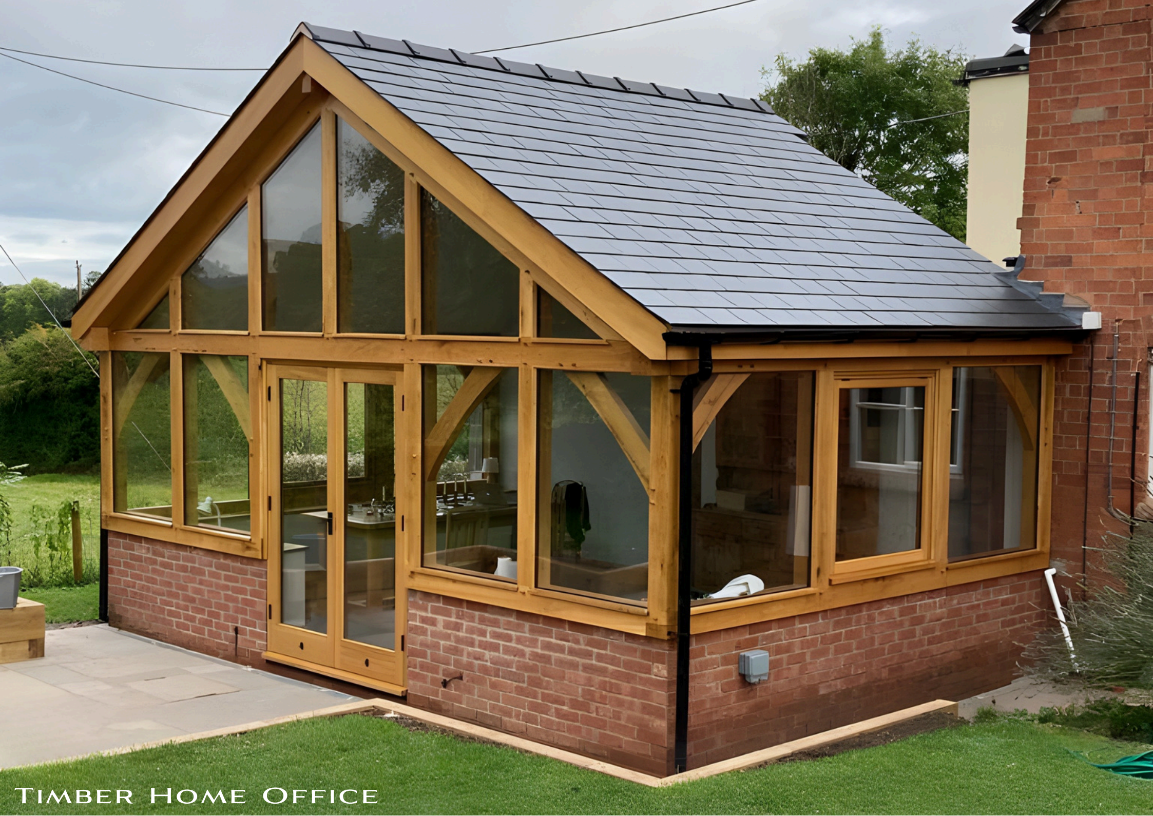
TIMBER HOME OFFICE